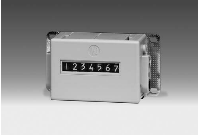
U 401 - Revolution counter