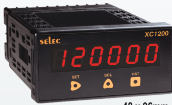
48 x 96mm