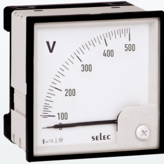
72 X 72 / 96 X 96mm