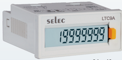
24 x 48mm