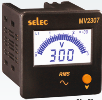
72 x 72mm